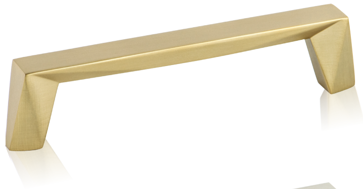
Pulls – 96mm CC

Longer length pulls are finding their way into designs more and this summer, they can be added in Matte Black and Slate in a 320mm CC size.