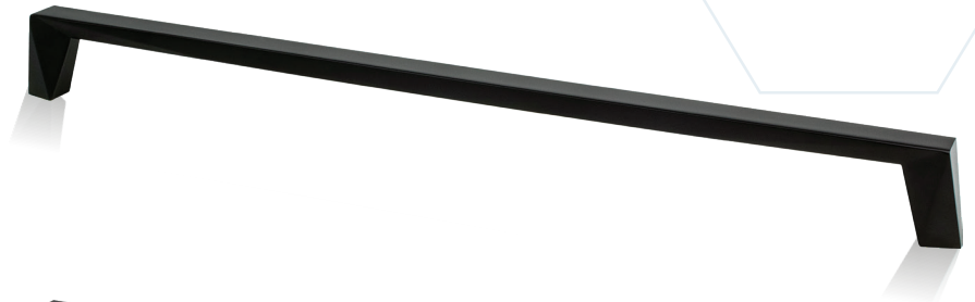
Pulls – 320mm CC